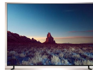
TV/ monitor power supply