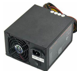
Server power supply