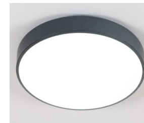
Lighting power supply