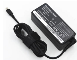
Adapter Power Supply