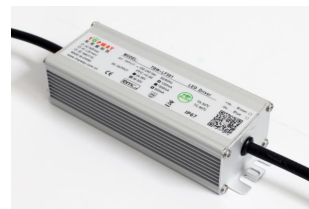
LED Power Supply