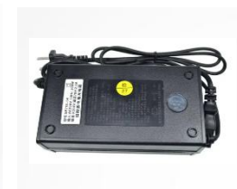
Two-wheeled Electric Vehicle Charger